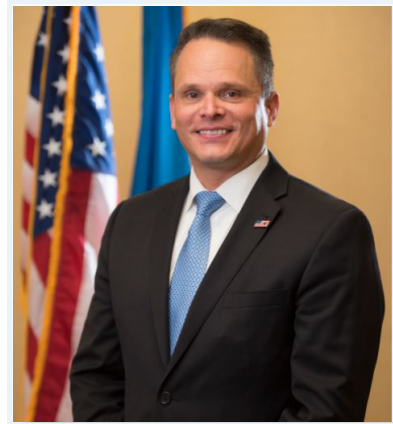
Trinidad Navarro Delaware Insurance Commissioner

A breast cancer diagnosis can be scary and thinking about insurance may be the last thing on your mind, but it's an important piece of treatment that must be considered.