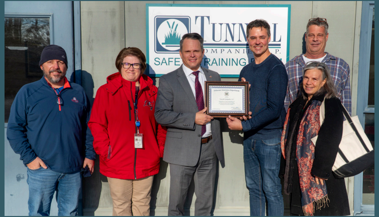
TUNNELL COMPANIES 25 Years of Safety