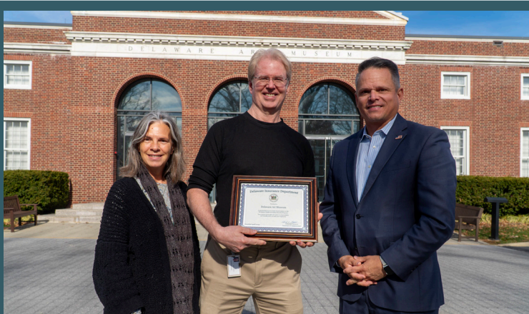
DELAWARE ART MUSEUM 25 Years of Safety