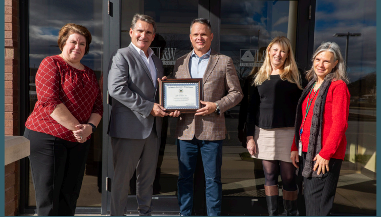
L&W INSURANCE 35 Years of Safety

If you are interested in how your business can participate in this program blank applications and frequently asked questions are available on our website.