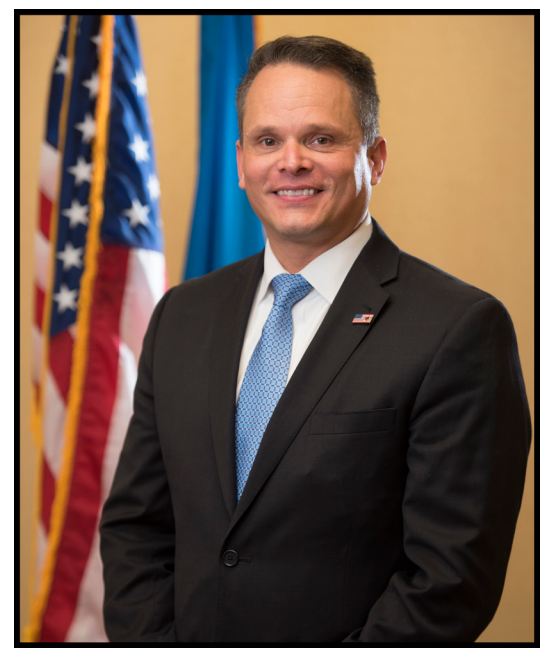
Trinidad Navarro Delaware Insurance Commissioner

Imagine a tag-team match between viruses, with the flu and COVID-19 joining forces. It's a scenario we would all rather avoid. By ensuring you have up-to-date vaccinations against both viruses, you're significantly reducing the risk of falling prey to this double whammy, which could potentially overwhelm your immune system.