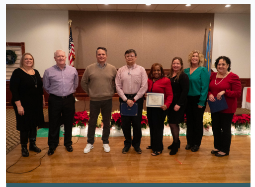
5 years with the State of Delaware