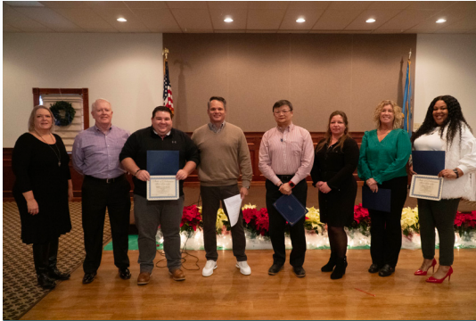
25 years with the State of Delaware