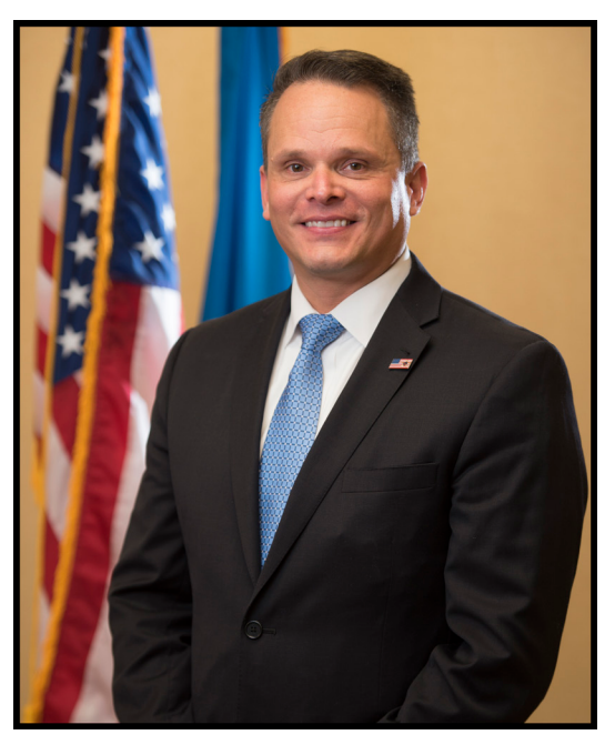
Trinidad Navarro Delaware Insurance Commissioner

Winter snow might be a dream to look at but it can be a nightmare for your home if not properly prepared. Winter storms cause over a billion dollars in losses every year but you can take preventative steps to insure you're not left out in the cold this winter. Start with checking your heating system. Before firing up your furnace have your heating system serviced. This should be a yearly inspection to make sure everything is working properly. Another good tip is to make sure you know where your main water shutoff valve is in case of freezing pipes. Trim trees and dead branches around your house as the winter snow can pile onto them and make them collapse under the weight. Seal any cracks that could lead to cold creeping into your house.